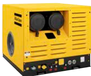
PTO Compressor with canopy